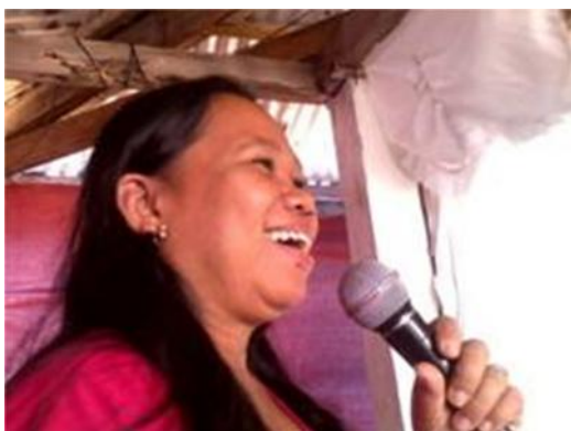
Figure Number 2. A woman fisher who is active in community work.

Cortes, a coastal town in Surigao del Sur of the Philippines. Besides fishing, farming is the second source of income. A scenic and a town where ecological protection goes hand in hand with its quest for sustainable development. A town with hospitable and industrious residents.