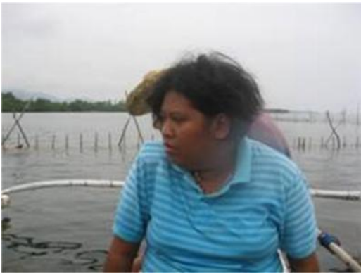
Figure Number 3. On-site Observation.