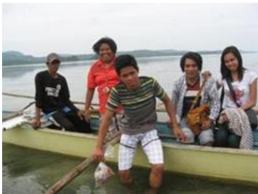
Figure 5. In the site with the help of research enumerators.