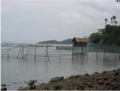
Figure Number 4. The fish cage on the site.